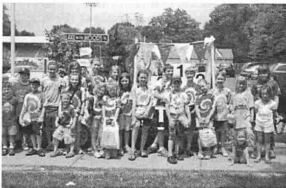
Loaded down with lots of candy to hand out during the Blossom Time Parade, our parade participants pose before getting started.